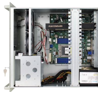
Motherboard size up to ATX 12" x 9.6"